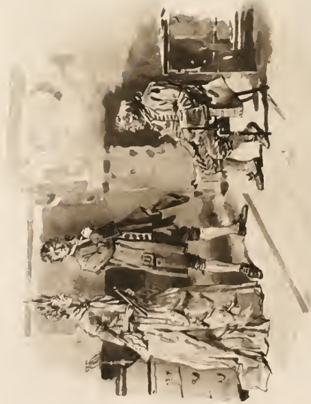
Barton's interview, Matthew Bramble and his surprise.